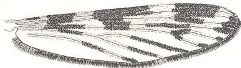
Wing of Anopheles chiriquiensis , n. sp.