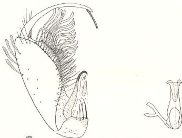
One-half of male terminalia of Aedes dominicii .

Considering the state of the art at the time the description was written (1907), that given by Rangel & Romero Sierra is very precise and accurate. However, several characters of the adult not mentioned by them should be given, to complete the record. These characters are taken from females bred from isolated larvae; males having the characters in the terminalia as given below for dominicii were bred from apparently identical larvae. In both sexes the paired median silvery-white mesonotal lines extend posteriorly to the scutellum, where they meet. The middle lobe of the scutellum is silvery-scaled, and with the lateral lobes, has many long coarse bristles. The two median lines reach the anterior edge of the mesonotum, but do not extend over it. At the anterior prominence, between the lines, is a silvery spot. A silvery line on each side outlines the anterior edge of the mesonotum. On each side of the paired median lines, are paired submedian lines, which do not extend to the anterior edge of the mesonotum. These lines are expanded at their anterior ends, terminating in a rounded, laterally directed part composed of larger, broader white scales. Sides of thorax with patches of very broad, silvery white scales; one patch anterior to root of wing; several patches on the proepimeron and mesepimeron unite with those on the pronotum to form a broad