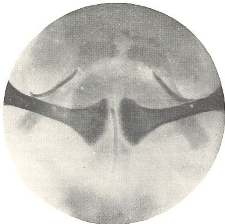
FIG. 2. Photograph of shoulder girdle, stained and cleared. The large bones are the coracoids; the small are the clavicles.

gray ground color of the sides merges gradually into the flesh color of the venter.