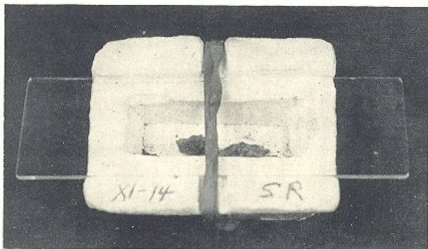
FIG. 1. Plaster of Paris cell covered with microscope slide, for making observations on eggs and other stages of chiggers.

Twice a day until the chicken is free of chiggers (a week to 10 days) the engorged larvae are collected from the water surface onto small squares of paper. The corner of a piece of paper is dipped into the water beside a floating chigger