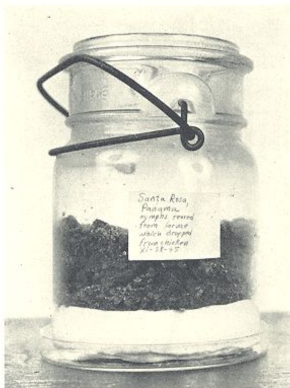
FIG. 4. Rearing jar made by replacing bottom of fruit jar with plaster of Paris. Nymphal and adult chiggers live in mixture of soil and chicken manure.

Within a week or 10 days engorged larvae transform to nymphs in the plaster lined jars with very little mortality. (Longer periods are required for some species.) When all have transformed the nymphs are shaken out of the jars lined with plaster of Paris into prepared rearing jars. The most successful rearing jar so far used is a pint fruit jar with the bottom broken out and replaced by a plug of plaster of Paris about three-fourths of an inch thick (Fig. 4).